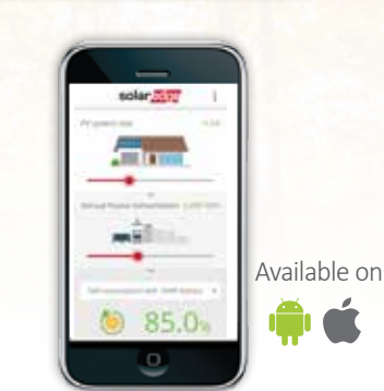
Simulator to estimate your self-consumption following installation of the StorEdge solution in your home

Unused PV power is stored in a battery and used when needed to help meet your home consumption demands. StorEdge is a DC-coupled battery storage solution providing higher system efficiency than AC-coupled solutions.