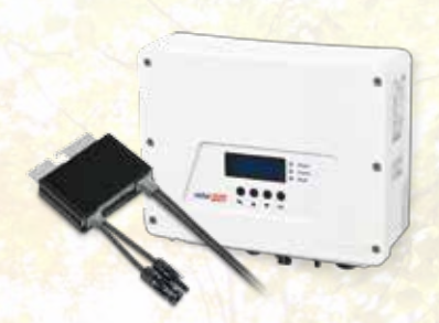
Power Optimiser Inverter

By installing a SolarEdge PV system, you can easily upgrade it in the future with our battery storage and home automation solutions, all under the control of a single Solar Edge inverter.