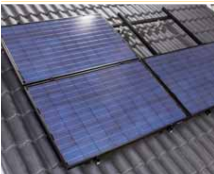
Mount the PV modules