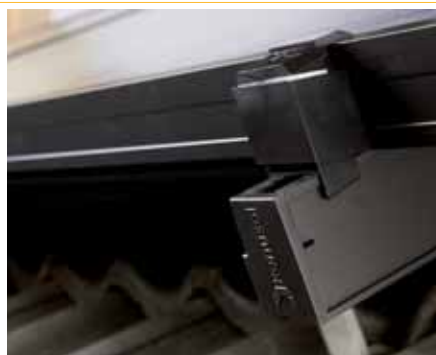
VarioSole SE blackline