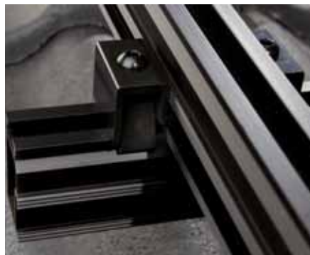
Fix the mounting rail