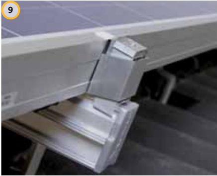
9 Mount the end caps