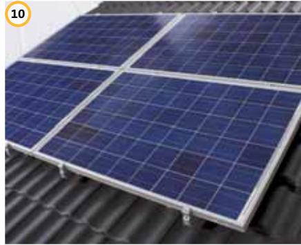
10 VarioSole SE sistema a guide incrociate