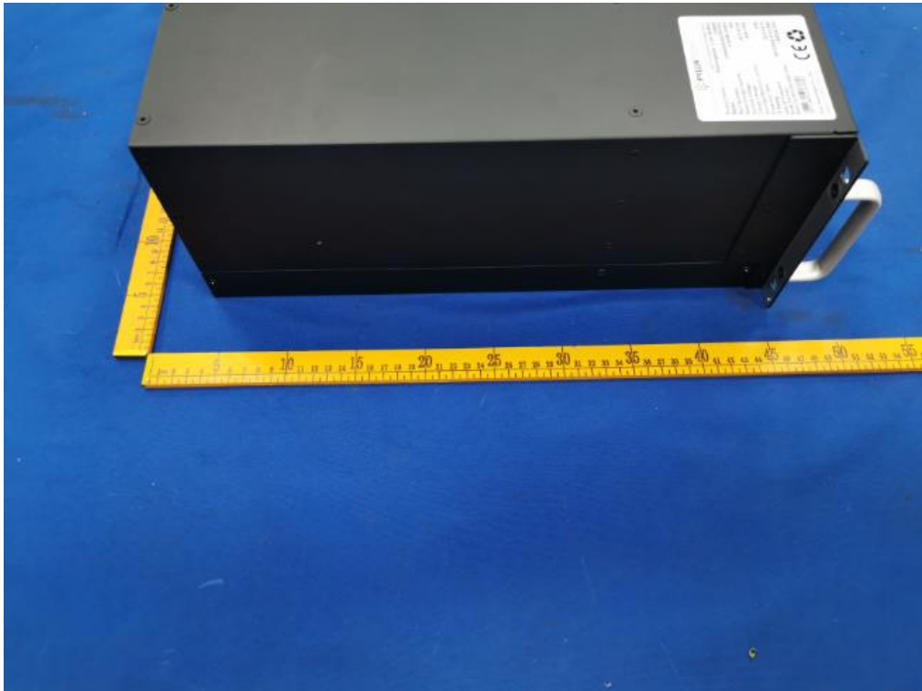
样品图片 (Sample photograph) -4