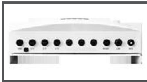
Bottom View EPM Plus 5G

The Solis EPM 5G is a device that allows you to adjust export values to satisfy local network regulatory requirements.