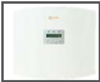
Front View EPM Plus 5G