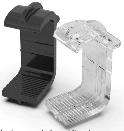
Key Descriptions and Specifications: