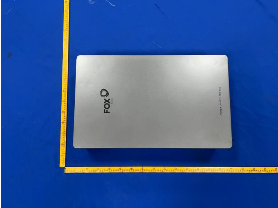
样品图片 (Sample photograph) -2