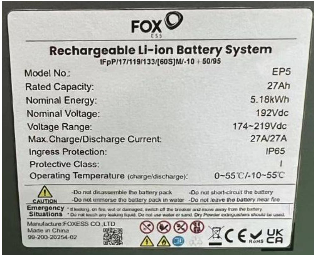
样品图片 (Sample photograph) -8