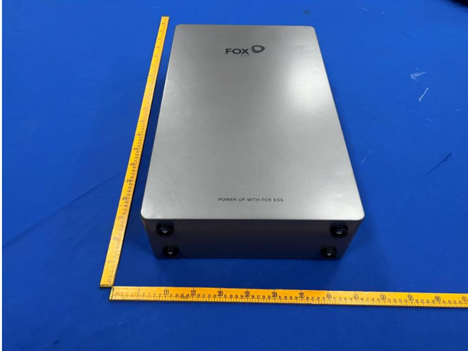
样品图片 (Sample photograph) -6