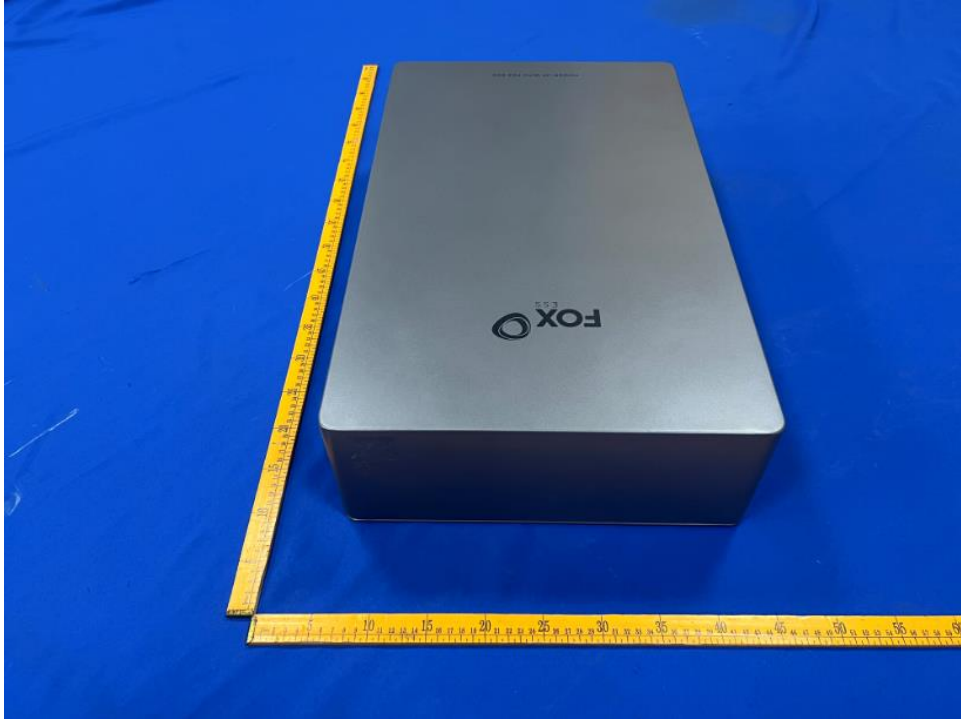
样品图片 (Sample photograph) -4