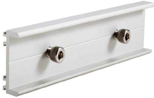
Splice for Standard Rail Part No.: ER-SP-ST