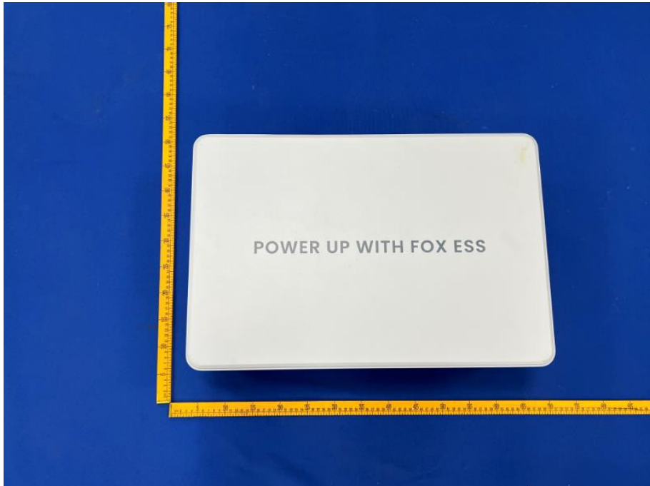
样品图片 (Sample photograph) -2