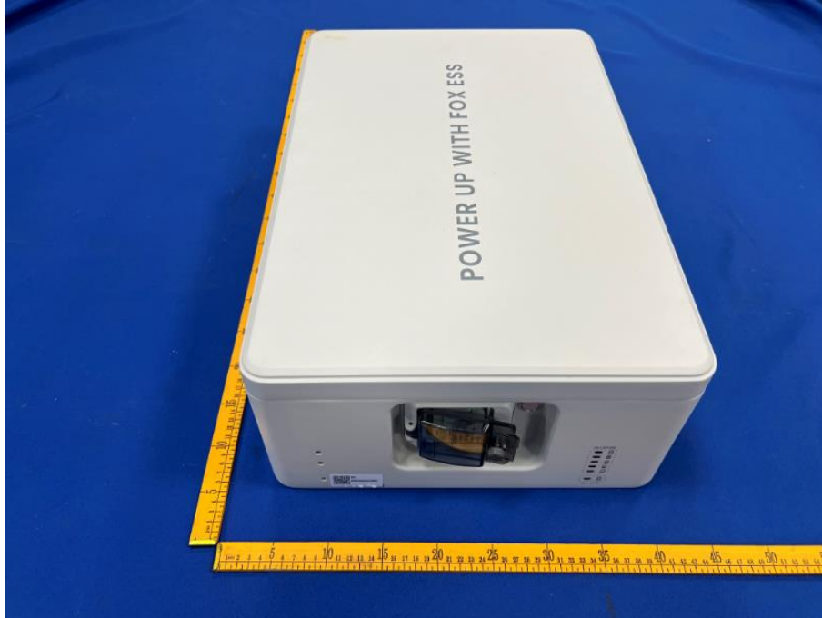
样品图片 (Sample photograph) -4