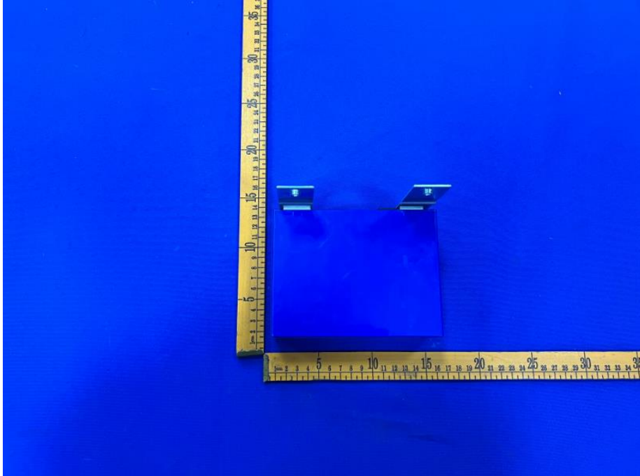
样品图片 (Sample photograph) -10