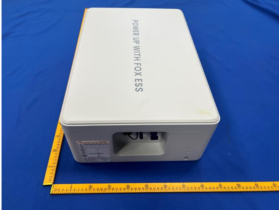
样品图片 (Sample photograph) -6