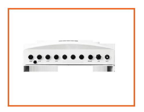
Front View EPM Plus 5G

The Solis EPM 5G is a device that allows you to adjust export values to satisfy local network regulatory requirements.