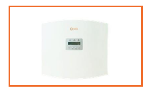
Front View EPM Plus 5G